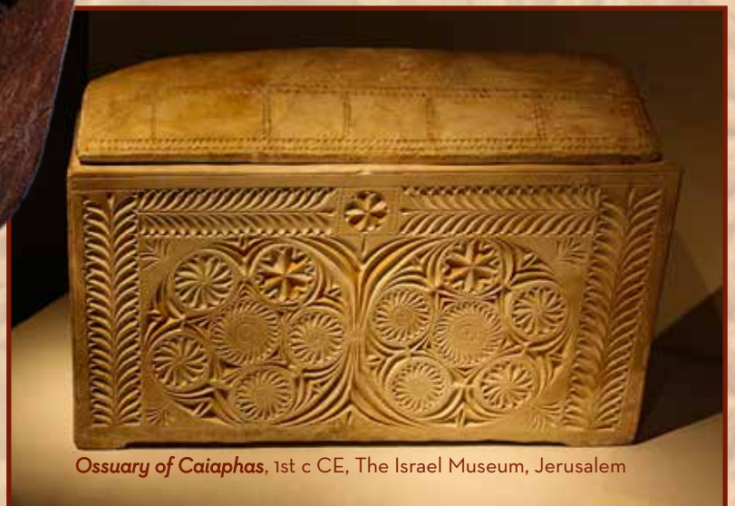
Ossuary of Caiaphas , 1st c CE, The Israel Museum, Jerusalem

Monday, September 11, 2017 Kiva Auditorium (UNM Campus) 1:00 – 2:00 pm Lecture (Q & A to follow)