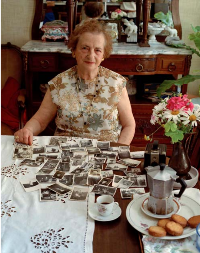
GAY BLOCK ©